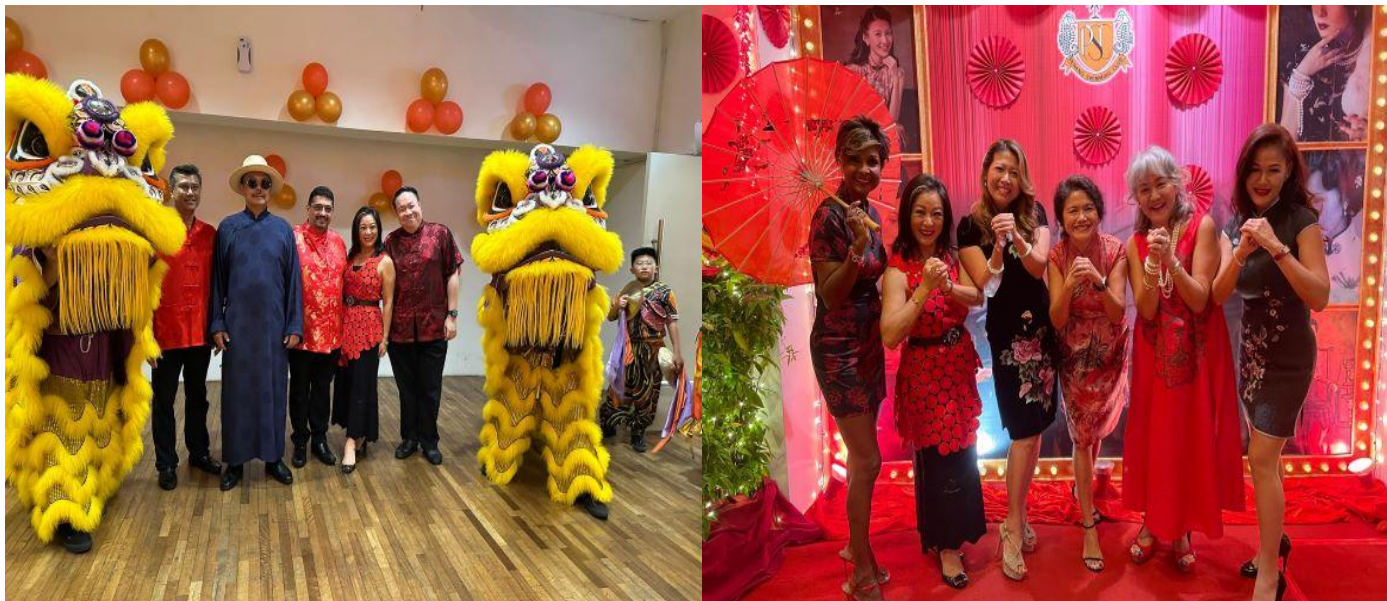
Stepping out in style