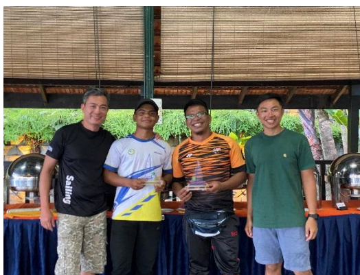
2 nd : "Doraemon" & "Mat Kenyang" PKSA & PSC