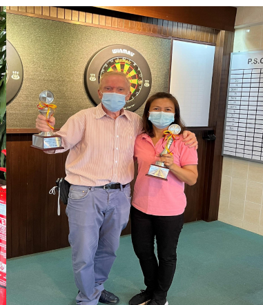
The Competition Winners