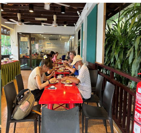
Mid-Competition High Tea