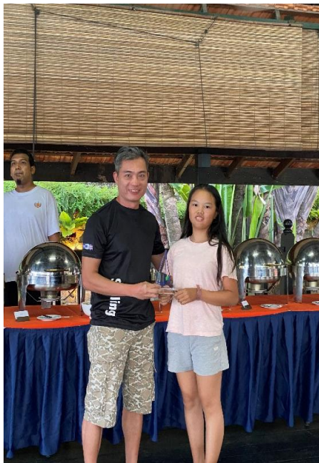
1 st : River Ng -PSC