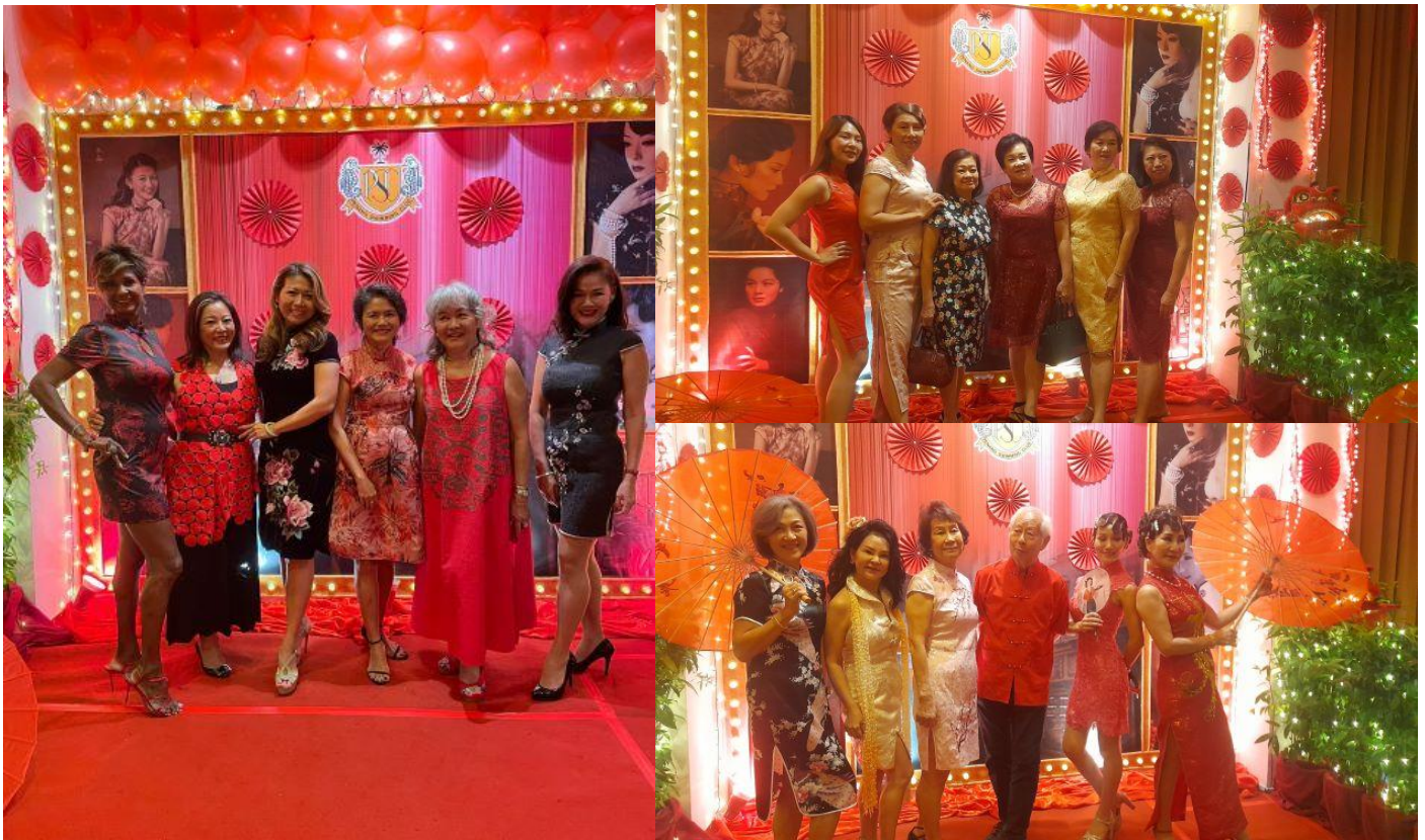
Dressed for the occasion