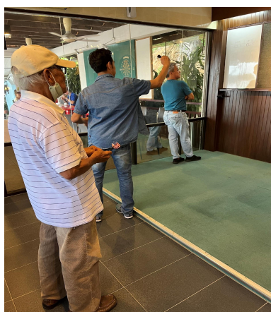
The Competition in progress