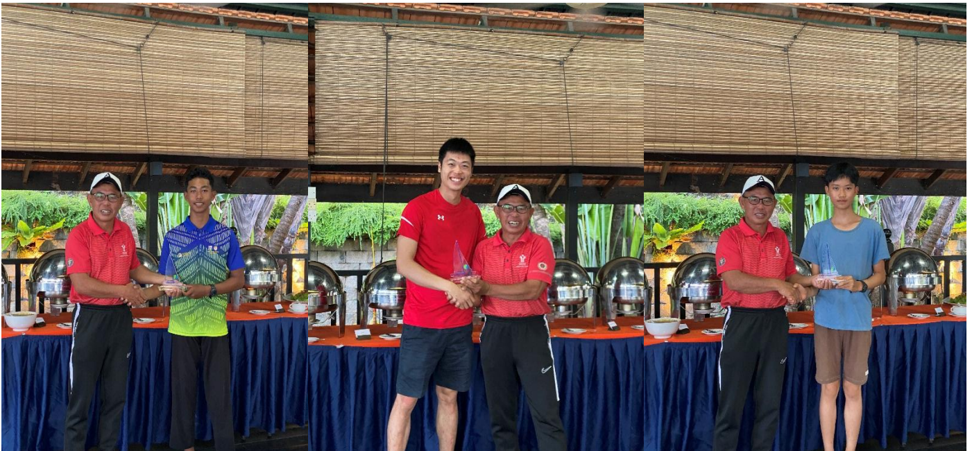
1 st : Wan - PKSA