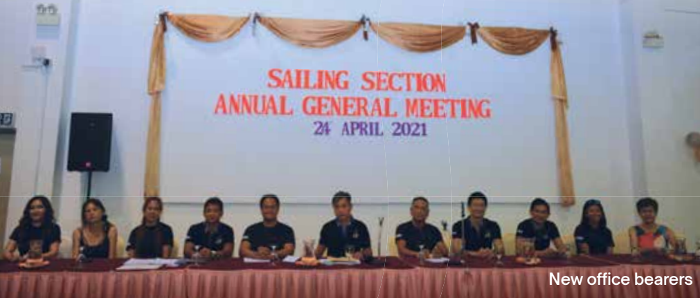
New office bearers