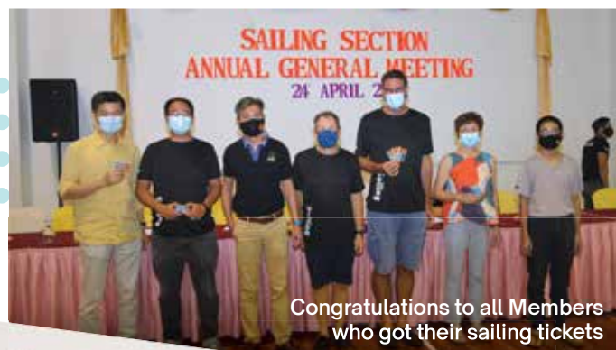
Congratulations to all Members who got their sailing tickets