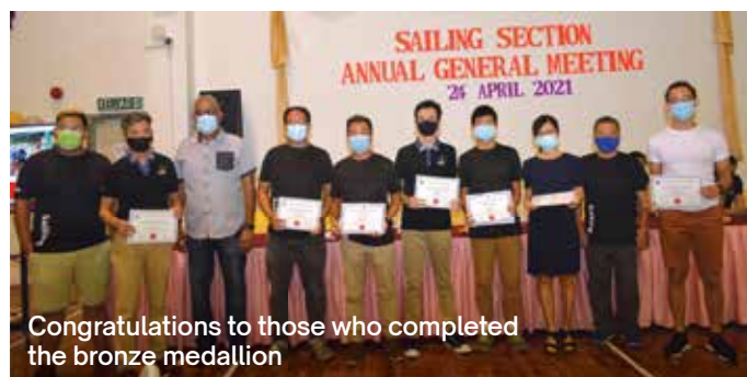
Congratulations to those who completed the bronze medallion