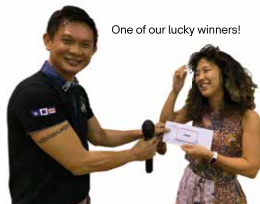
One of our lucky winners!